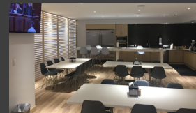
Modern Conference Rooms

TO LEARN HOW THE COPPOLA-CHENEY GROUP CAN HANDLE YOUR REAL ESTATE REQUIREMENTS PLEASE CONTACT US OR VISIT OUR WEBSITE: WWW.C2TECHGROUPS.COM